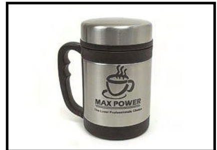
Stainless Steel Beverage Mug

A: Stainless steel, tool steel, brass, chrome, aircraft grade aluminum, pewter and titanium. It's important to remember, brass requires more power - at least a 50 watt laser and some products, such as sterling silver, will require testing.