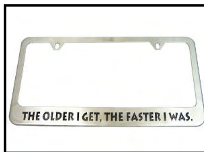
Stainless Steel License Plate Holder